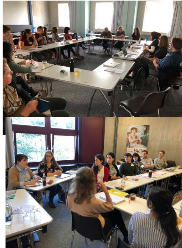
Above: "Narratives of (Un)sustainability"