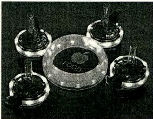
The robots communicated to identify the 'food'

But this theory has been impossible to prove, given the lack of time machines or lack of fossil evidence of ancient tongues.