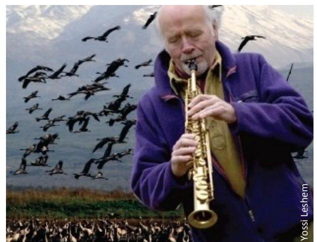
Composer and musician Paul Winter opened and closed our event, playing excerpts from his new composition "Flyways"