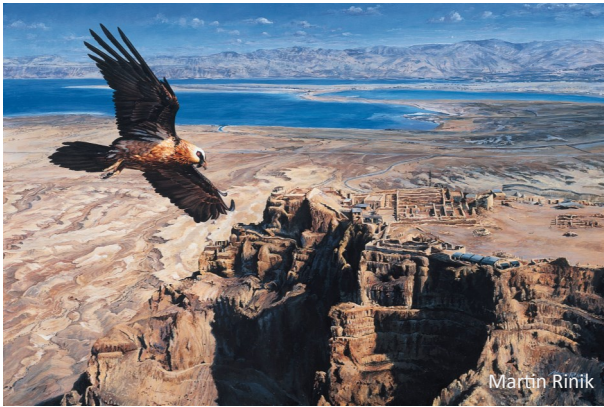
The Bearded Vulture ("Peres" in Hebrew), whose name was adopted by Israel's 9th President Mr. Shimon Peres, went extinct as a breeding species in the Middle East as of 1982. In that year the last pair nested next to the Dead Sea in the Great Rift Valley