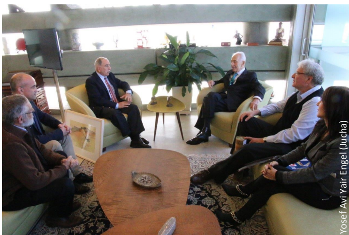
Meeting with Israel's 9th President, Mr. Shimon Peres, after the Davos event at the Peres Center for Peace in Tel Aviv-Jaffa on Wednesday, February 10 th 2016