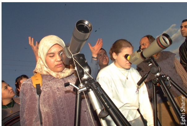
Muslim and Jewish students observing cranes together in the Hula Valley in northern Israel