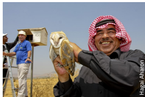
A Jordanian farmer holding a Barn Owl next to a nesting box in the Beit Shean Valley, Israel, part of the regional project for using Barn Owls and Common Kestrels as biological pest control agents in agriculture