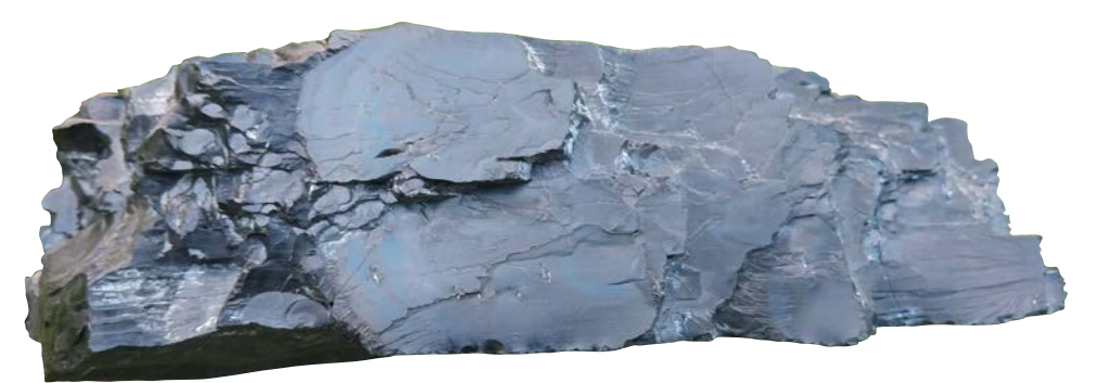
A big fragment of rough. Note the characteristic conchoidal fracture.

Characterisation of Asturian jet is still an important issue today. As no mines are in operation, rough material arises from stocked material and dumps from ancient mines and coastal sea cliffs.