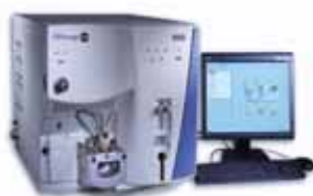
At qMSF, we have a Triple Quadrupole and a Linear Ion Trap MS instruments