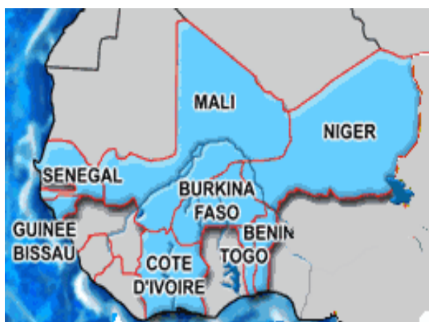
Figure 1: The West African Economic and Monetary Union

The long experience in intra-regional cooperation in SSA makes WAEMU a good case study to consider issues related to South-South trade. The WAEMU was before 1994 a monetary union formed in 1963 to consolidate the common currency used within French colonies. During the 1990s, the drastic economic situation faced by these countries encouraged them to reinforce their solidarity in a deeper economic integration. Whether this region is an optimal currency area and how it may impact trade is not examined here (see Bénassy-Quéré and Coupet , 2003).