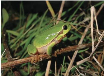
Master of Science in Behaviour, Evolution and Conservation (MSc BEC)

The degree awarded for each of these 3 Masters is as follows: