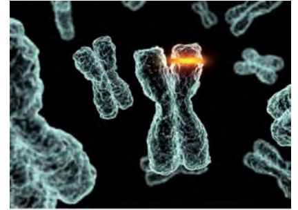
Master of Science in Molecular Life Sciences (MSc MLS)

Particular focus is placed on practical work throughout the Master's programme, consisting of: