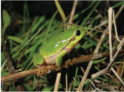
Master of Science in Behaviour, Evolution and Conservation (MSc BEC)

The qualifications awarded for the three Masters' programmes are as follows: