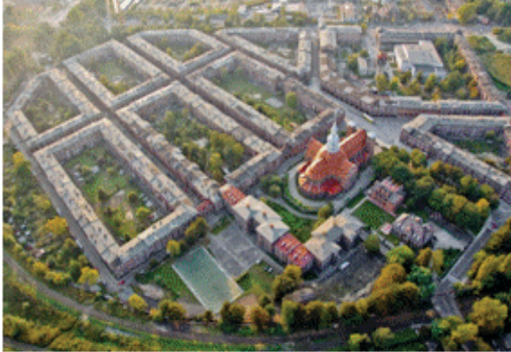
? ?? ?? ?? ? ?? ?