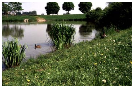
Rainwater retention basin