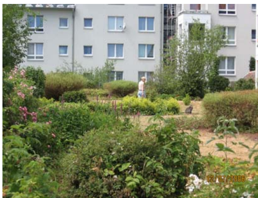
Underground garages with roof planting

Rainwater runoff from sealed surfaces must be channelled into a Hollow-and-Trench soakaway system and infiltrated there and/or directed to limited-flow discharge to the public drains. This system achieved decentralised retention, combined with as much infiltration as possible and strictly controlled release into public drains. This was in accordance with the soil conditions on Kronsberg, with an average permeability of 1 \times 10^{-7} m/s (determined by the Water Planning Team, 1995). Exceptions to this concept were possible according to the Development Plan if the rainwater was completely infiltrated on site, within the property boundaries, or could be diverted to controlled discharge in other areas. As impact minimisation measures according to the nature protection law, property owners were obliged to use permeable surfaces for car parking and their access roads, to plant the roofs of underground car parking and to plant roofs with a slope under 20% in certain parts of the development area.