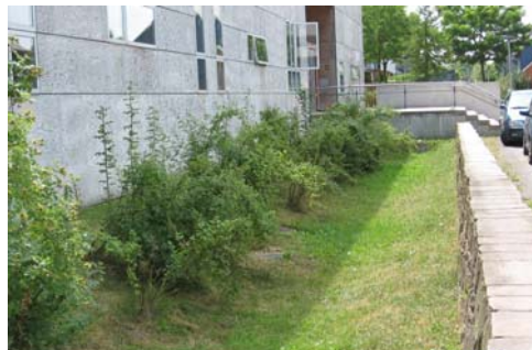
Kindergarten: Hollow-and-Trench soakaway system

Kindergarten I is drained with a Hollow-and-Trench soakaway system. Interior drainpipes channel the water from the gravel-covered roof into the hollow, where it is infiltrated through the soakaway trench. The paved paths also run off into the hollow. The few parking spaces are paved with permeable surfaces, so that rainwater can be infiltrated in situ.