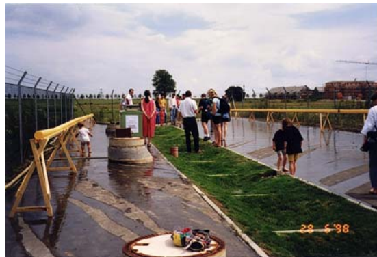
The demonstration stretch

This demonstration stretch was monitored by the University of Hannover as part of the research project funded by the federal construction ministry, 'Rainwater management at Hannover-Kronsberg'.