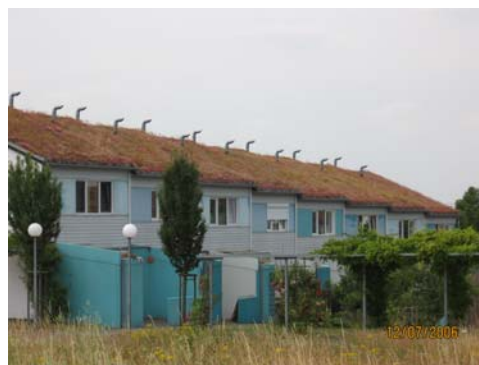
Terraced houses with roof planting

All roofs are greened, which also contributes to the rainwater management concept.