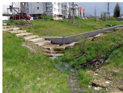
Hillside avenues with dammed water areas and streams