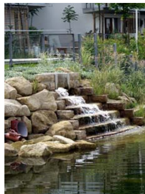
Views of an inner courtyard