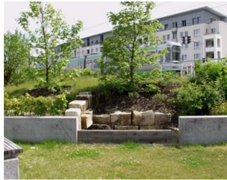
Retention areas with periodic hollows and stone benches