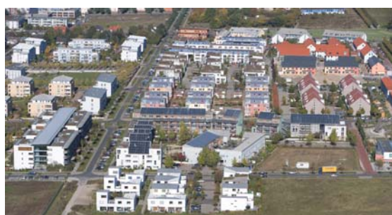
Ariel view of Kronsberg (south area), 2006

The new district is compact. Built structures become less dense and lower as one ascends the 4-6% gradient on the western side of Kronsberg hill and approaches the countryside and the crest of the hill; from west to east there are three zones of different storeys, building density and construction type. In the west of the district, along the main access road Kattenbrookstrift/Oheriedentrift and the tramline, are the highest buildings of 4½ storeys in rows and blocks and thus the highest use intensity. The middle of the district mainly contains 3½-storey buildings, and on the upper edge of the development are 2½-storey terraced houses.