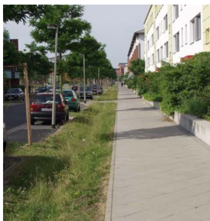
Roadside Hollow-and-Trench soakaway system

Use of the Hollow-and-Trench system is compulsory for all public traffic areas. It is laid parallel to the streets in the grass verges between the pavements and the parking spaces, where there is a total gap of 2 metres. To calculate the extent of the hollows, 10 percent of the adjacent runoff area is sufficient. During occurrences of design rainfall, the hollows back up to a calculated depth of just 16 cm.