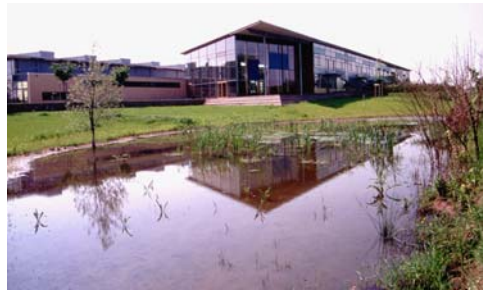
Kronsberg primary school

As well as the exemplary technology, water and its sparing use is also an important teaching theme.