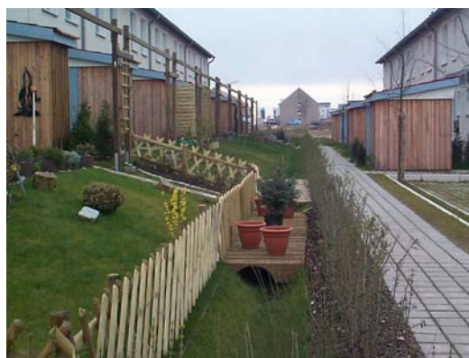
Terraced house gardens

Where building density is greater, for instance in the terraced house developments, there were problems with the use of the areas which affected planning of the soakaways. Terraced house gardens are usually less than 50 m 2 . Here, the tendency was to underground soakaways, so that the gardens could be used for other purposes. Some owners have covered the surface soakaways to extend the usable area of their small gardens.