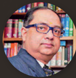
Mohan Parasaran India