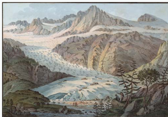
CAPTION: "The three transparent sources rise at the back of the hill, at the basis of which stand the small chalets or huts, as represented in the drawing, the author having taken the view from the top of a small plateau, or flat surface, which commands the extensive glacier of La Furca, and icy Vault, from where issues a part of the Rhône, as described. On the right stands the mountain which bears its name, and on the left the basis of the Grimsel"

"Source of the Rhône and glacier of La Furca", Albanis Beaumont Jean-François, Travels from France to Italy through the Lepontine Alps, London, 1800, Bibliothèque cantonale et universitaire de Lausanne, cote: AC 389